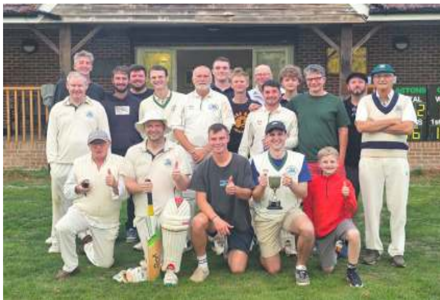
The triumphant Cup-winning squad from last September

For over 40 years now, the club has played friendly (non-competitive) fixtures every Sunday afternoon against local villages, providing the opportunity for villagers of any standard to play cricket.